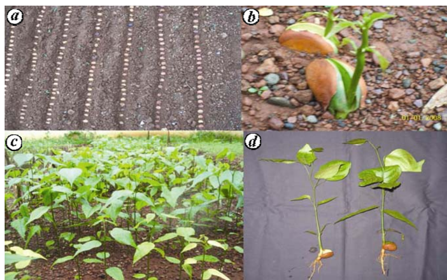
Figure 1. Progeny trial of Pongamia pinnata undertaken in nursery condition. a , Seed sowing; b , Germinating seeds; c , Seedling in nursery, and d , Uprooted seedlings.

analyses using statistical software Mstat-c following appropriate methods 7 .