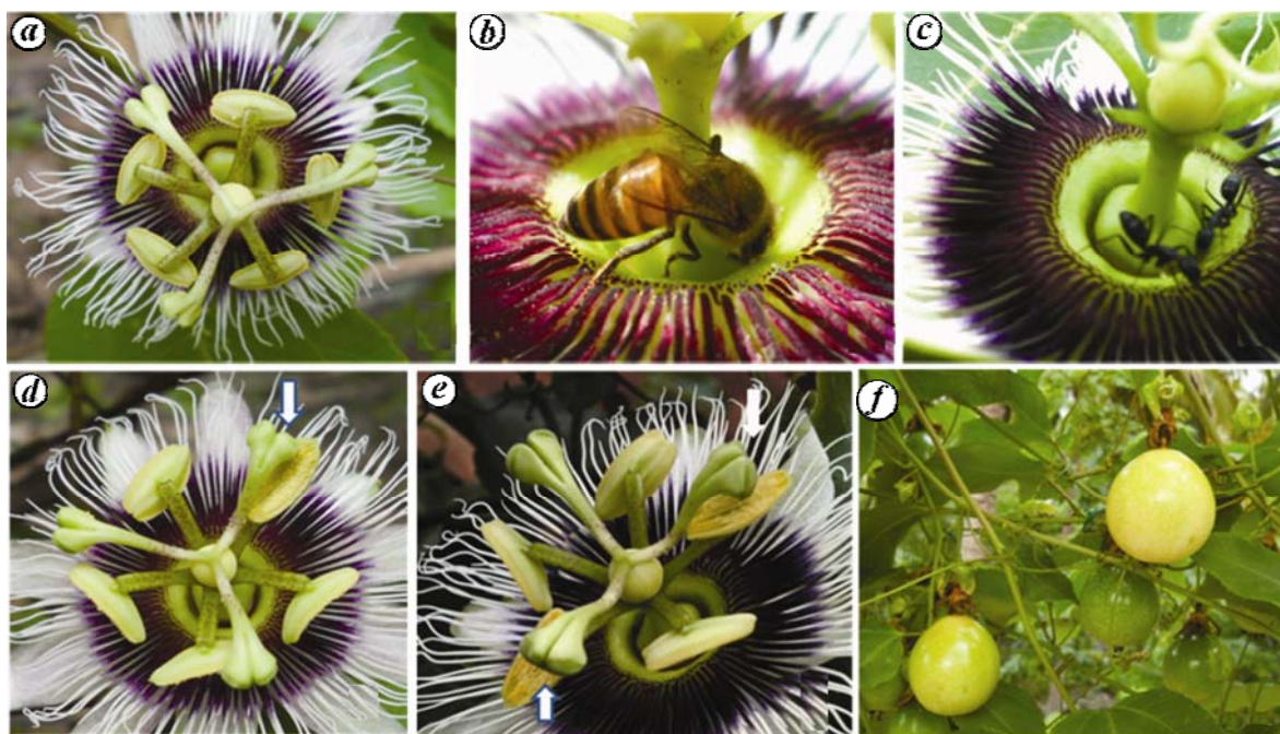
Figure 1. Floral morphology, floral visitors and autogamous pollination in Passiflora edulis F. flavicarpa . a , Flower photographed from the top. b , Apis cerana foraging the nectar. c , Camponotus sp. foraging the nectar. Anthers have been removed before photography. d and e , Flowers photographed soon after anthesis to show autogamous pollination of one stigma ( d ) and of two stigmas ( e ). Regions where anthers touch the stigma are shown by arrows. f , Ripened fruits.

a stereomicroscope into 2 ml of water containing a few drops of a detergent (to prevent clumping of pollen grains) taken in a well of a titre plate to release all the pollen grains; the debris was removed under a stereomicroscope. Then 0.2 ml of pollen suspension ( N = 3 for each anther) was spread on a slide in the form of a narrow band and allowed to dry. A graph paper was stuck below the slide and the number of pollen grains was counted along the grids of the graph paper under a binocular stereomicroscope fitted with an incident light source. The scores were computed to calculate the number of pollen grains per anther. To count the number of ovules in each ovary ( N = 10 ), the ovary was cut longitudinally into four parts and the ovules from each part were scraped into 2 ml water containing a few drops of a detergent. The suspension was spread on four slides (0.5 ml/slide) and the number of ovules was counted after sticking a piece of graph paper below the slide.