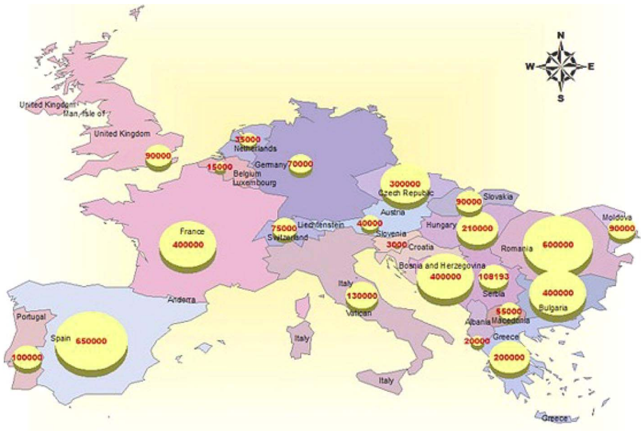
Figure 2. Estimated Romani population in Europe (Source: People’s World Peace Project, 2010).