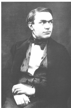
Alfred Nobel at the age of about 30 years (Courtesy of the Nobel Foundation).

Nobel Prize rewards new discovery, the product of exploration beyond the edge of the known into the vast spaces of the unknown and mysterious (Baruch S. Blumberg, Nobel Laureate in Medical Sciences, 1976). It concerns a phenomenon of major importance and its unravelling has a huge impact for the way science is conducted subsequently. To receive a Nobel Prize is an incredible honour that brings an unprecedented respect and recognition from colleagues and perhaps the world at large. In addition to the recognition by the scientific establishments, Nobel laureates acquire a prestige to make authoritative statements even on matters outside their field. What is it that confers on them the unique privilege? Have all the Nobel Prize-winning discoveries really revolutionized our understanding on medicine to the expectations? And have they fulfilled the laudable intention of recognizing discoveries that are 'to the benefit of mankind'? One possibly gets some ideas after reading this book.