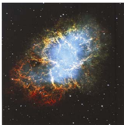
The Crab Nebula in Taurus (VLT KUEYEN + FORS2).