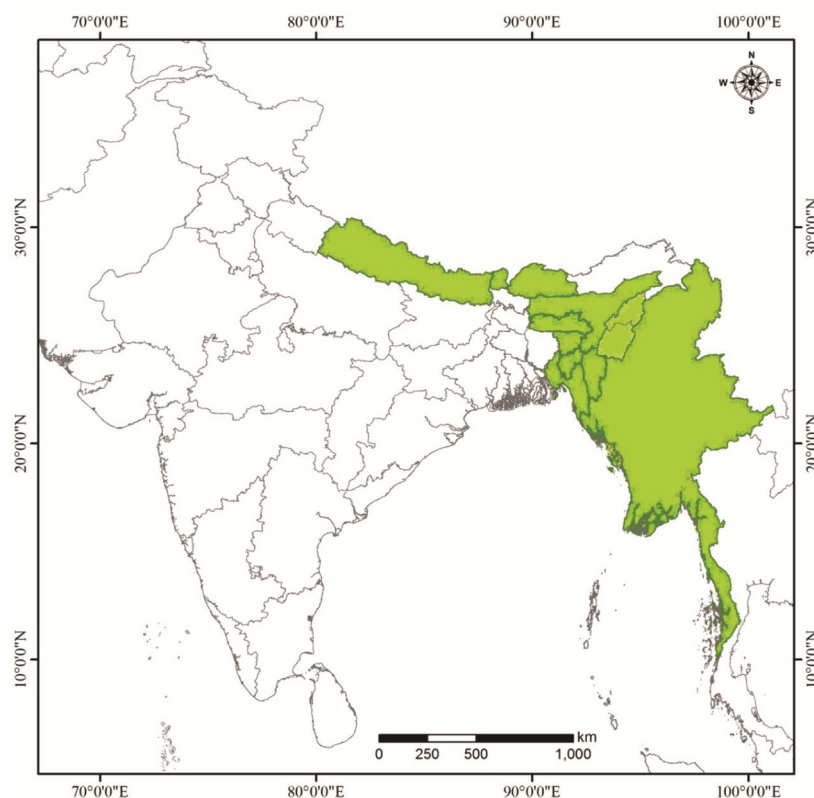
Figure 1. Map showing distribution of the species Schizostachyum dullooa in India, Bangladesh and Myanmar.

The default biomass carbon stock for an equivalent land use in South Asia is estimated at 138 Mg ha -1 (ref. 17), which is much higher than the vegetation carbon stock of the bamboo forest in the present study. Nevertheless, S. dullooa is an important raw material for household and industrial requirements in NE India. The potential to grow in fallows and on degraded lands 18 , makes this an eco-efficient species for NE India. Due to its diverse social and ecological role, the species must be conserved in its natural habitat. Moreover, plantation of this species in degraded lands and its introduction in home gardens will diversify its habitat and in the long term may