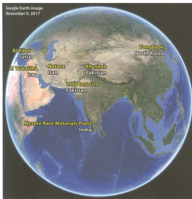
This Google Earth snapshot shows the areas of the globe the Institute for Science and International Security monitors frequently using satellite imagery. The labelled locations are featured as case studies in this article.

Another major area of research in Earth sciences has been the questions