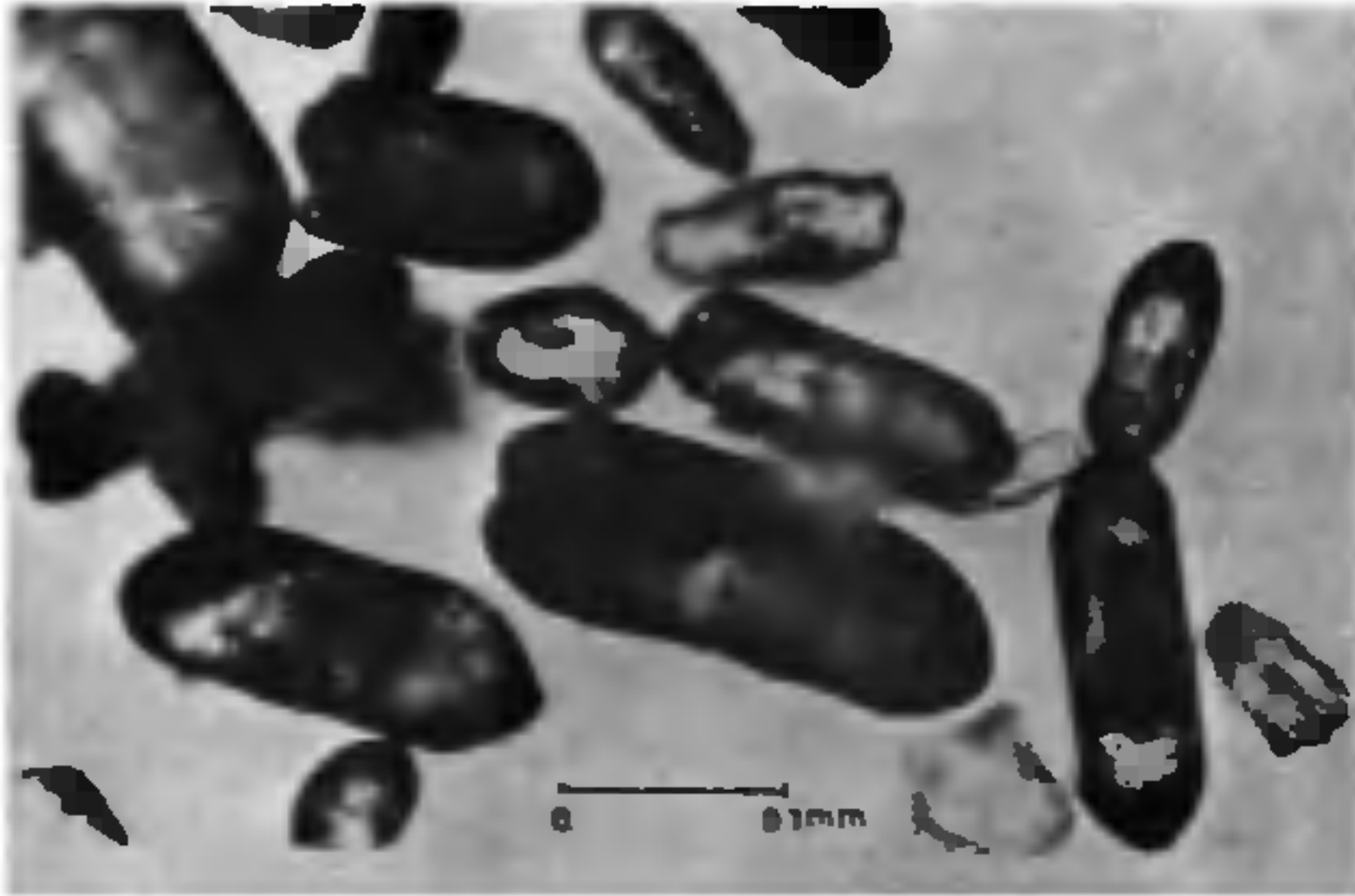
Figure 1. Zircons from quartzo feldspathic gneiss, Kottayam district, Kerala.

Characteristics of zircons: The studied zircons are colourless to pinkish brown (Figure 1). Seventeen percent of the zircons are metamict with rounded, dark, euhedral crystals. Fifty nine percent of the zircons are euhedral with simple and complex pyramidal