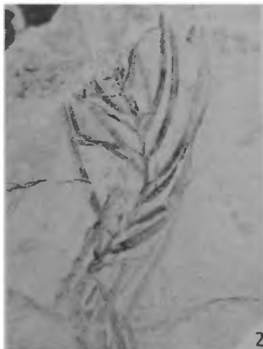
Figures 1 and 2. Torreyites sitholeyi (1. \times same size; 2. \times 1\frac{1}{2} ).