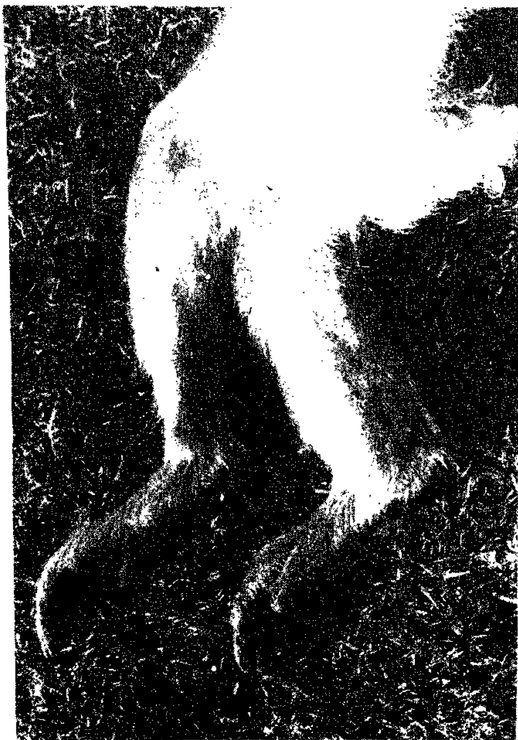
Figure 2. Swelling in right hind limb of Presbytis entellus (L-IV-21) exposed to 500 L 3 of Brugia malayi .

eastern countries, leaf monkeys with natural filarial infection ( B. malayi ) are not ordinarily encountered in India. Earlier studies with rhesus monkeys did not show encouraging results 3 . It was therefore, worthwhile to evaluate leaf monkey, a widely prevalent species in India as possible experimental host for B. malayi infection.