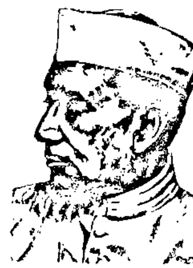
Birbal Sahr centenary, 199