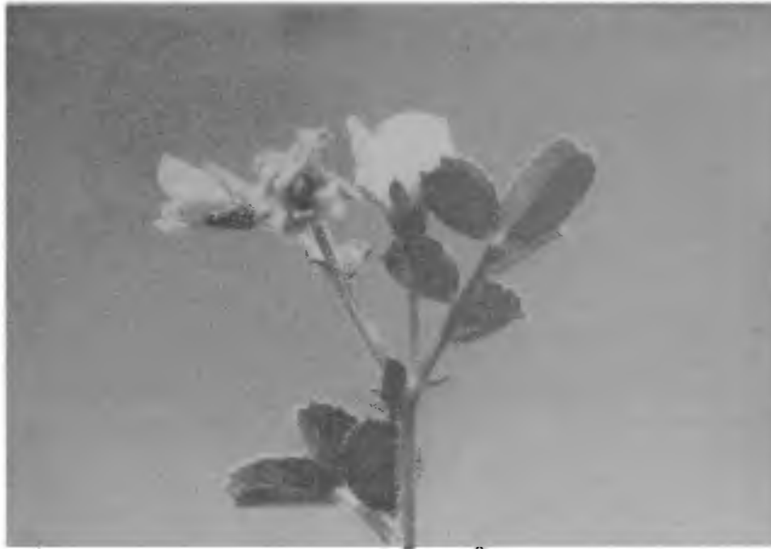
Figure 2. Variant of chickpea, isolated from gamma rays irradiated progeny of chickpea cultivar, ICCV 6, showing smaller leaf and determinate growth habit.