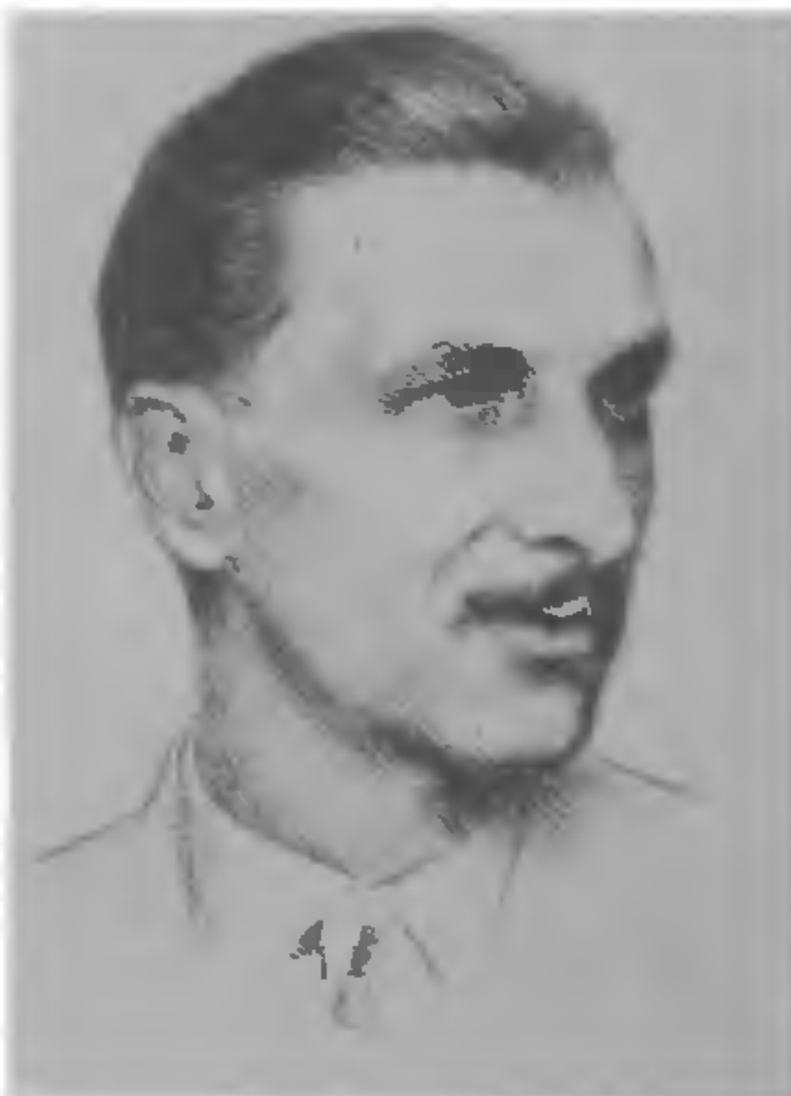
An artist's impression of young J R D.