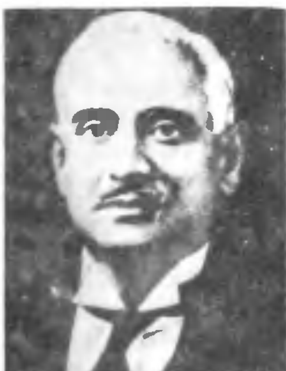
S. M. Sulaiman (1938–40)