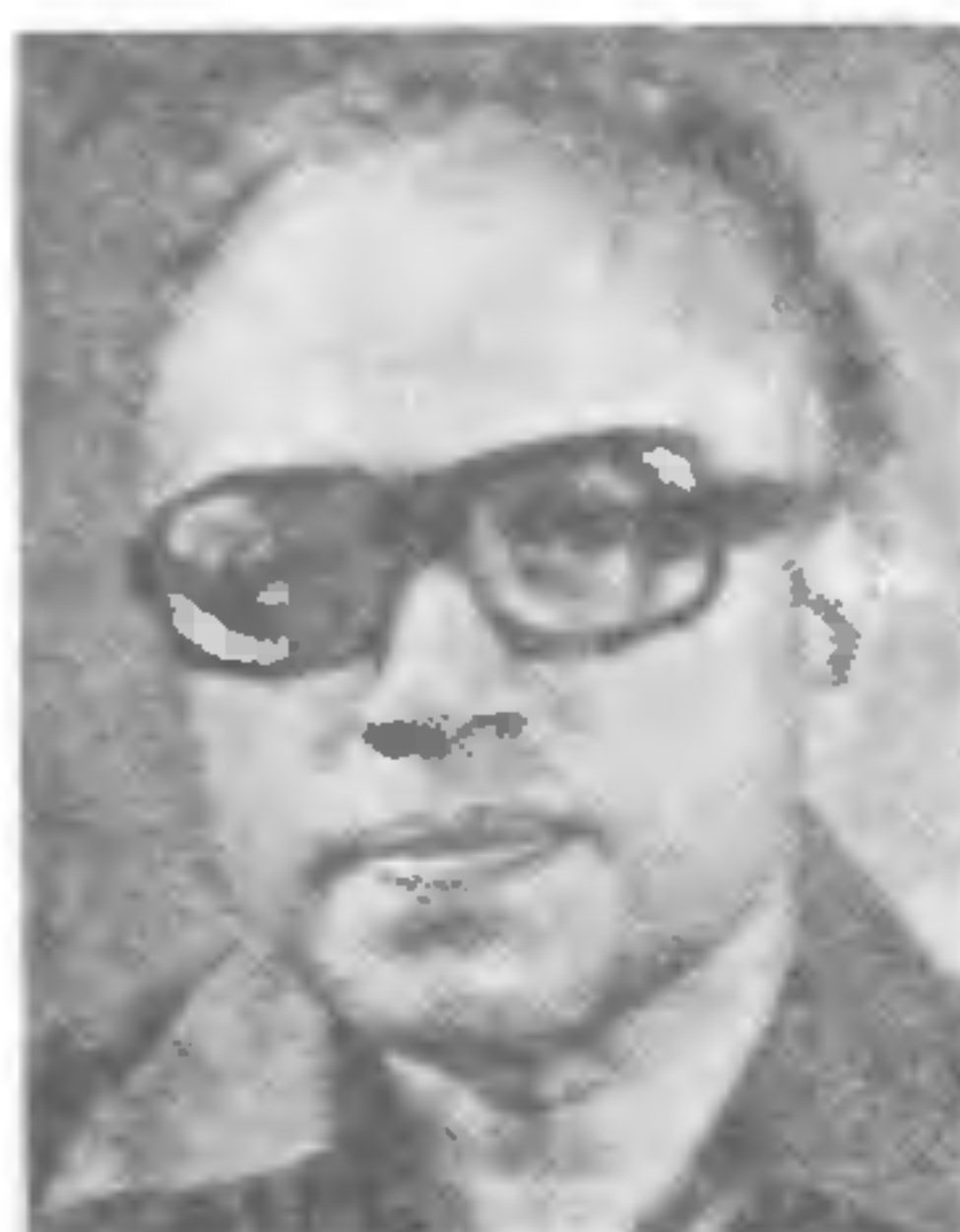
M. S. Swaminathan (1989–90)