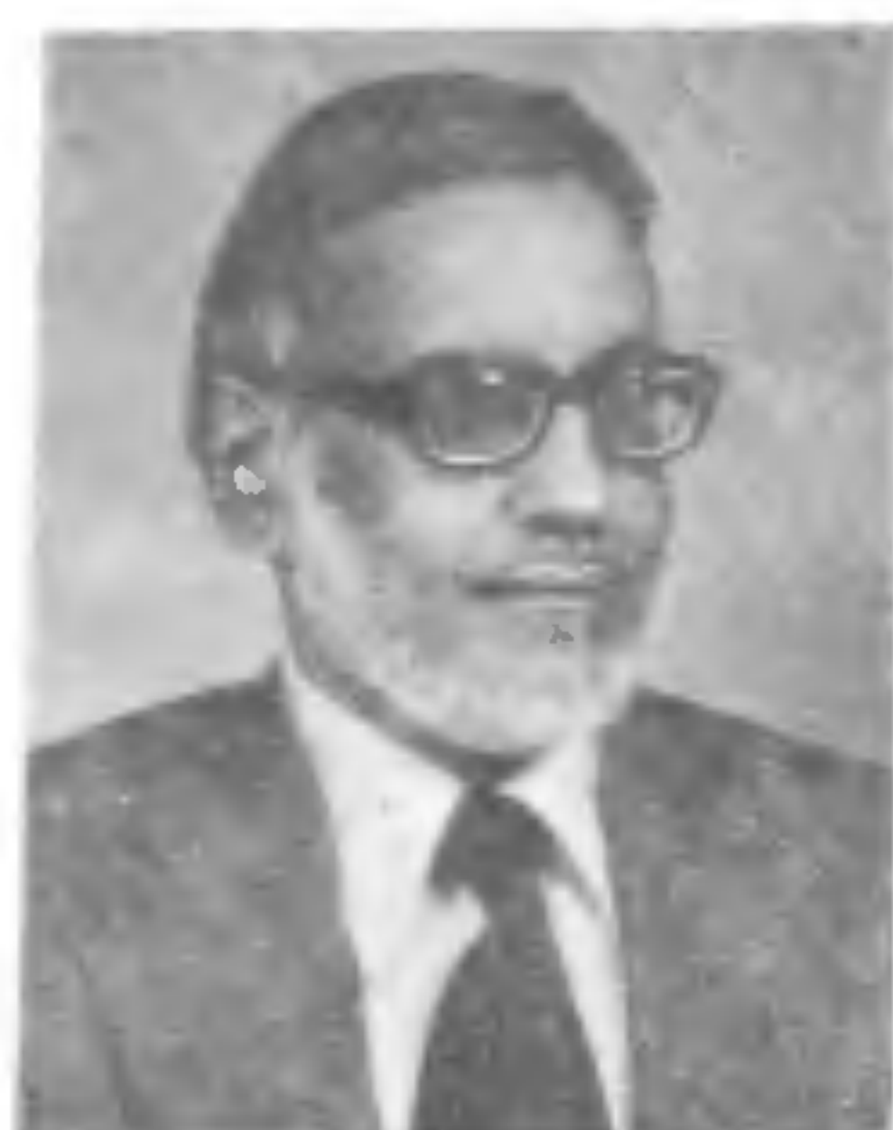
M. G. K. Menon (1987–88)