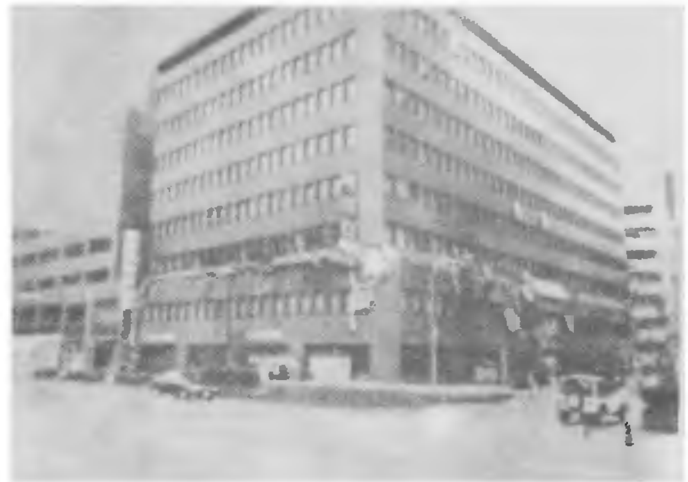
Figure 4. Storey collapse in a modern building in the Sannomiya district of downtown Kobe.

northwest. In this narrow transportation corridor, which links western Japan with northeastern Japan, all major transportation systems were severed by the collapse of elevated roads and railways, creating major dislocation of public and commercial traffic. The Shinkansen route – the high speed rail route between Tokyo and all of western Japan – was closed by the collapse of bridge spans in Kobe, as were two other rail lines. The elevated Hanshin Expressway, which is the main vehicular traffic artery through Kobe, was closed by collapses at three locations, one of which included a 630 m section of the expressway (Figure 3). Along this expressway, there was widespread evidence of ground failure: disrupted road pavement, subsidence of the pavement around manholes,