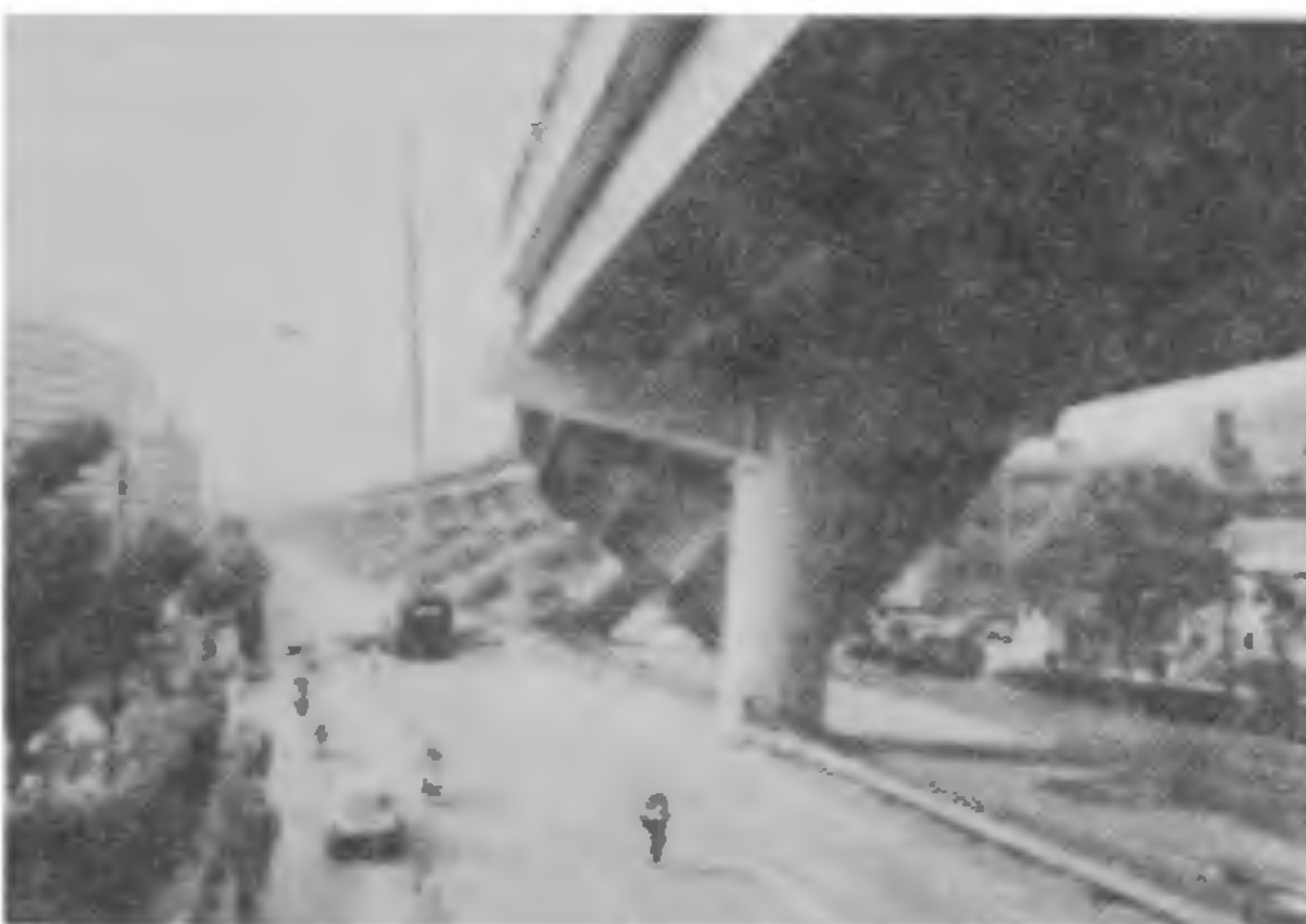
Figure 3. Collapse of the Hanshin Expressway in Nishinomiya.

northwest. In this narrow transportation corridor, which links western Japan with northeastern Japan, all major transportation systems were severed by the collapse of elevated roads and railways, creating major dislocation of public and commercial traffic. The Shinkansen route – the high speed rail route between Tokyo and all of western Japan – was closed by the collapse of bridge spans in Kobe, as were two other rail lines. The elevated Hanshin Expressway, which is the main vehicular traffic artery through Kobe, was closed by collapses at three locations, one of which included a 630 m section of the expressway (Figure 3). Along this expressway, there was widespread evidence of ground failure: disrupted road pavement, subsidence of the pavement around manholes,