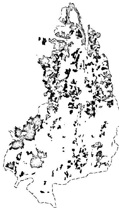
Figure 3. Map of BR Hills, south India showing intensive alterations in the land cover for the past two to three decades. The dark colours indicate frequent and intense changes.