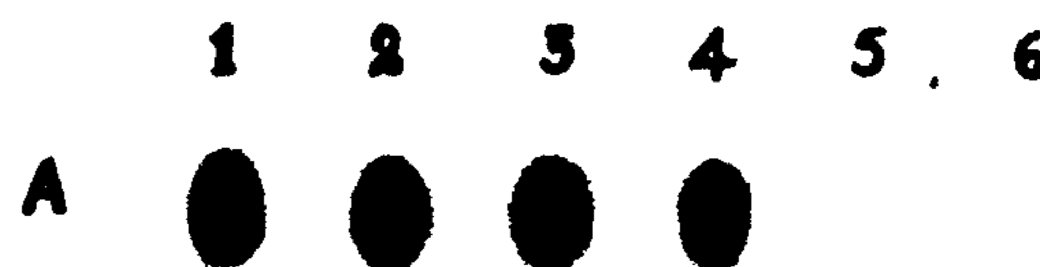
Figure 3. Slot-blot hybridization analysis of South Indian sugarcane virus isolates probed with ^{32}\text{P} -labelled pSV-7 insert of the Tirupati isolate from Chittoor district. Lane 1, Tirupati isolate (Chittoor district, AP) (SCSMV-AP); lane 2, Tanuku isolate (West Godavari district, AP); lane 3, Coimbatore isolate (Tamil Nadu); lane 4, Hospet isolate (Bellary district, Karnataka); lane 5, Healthy sorghum leaf; and lane 6, Buffer control.