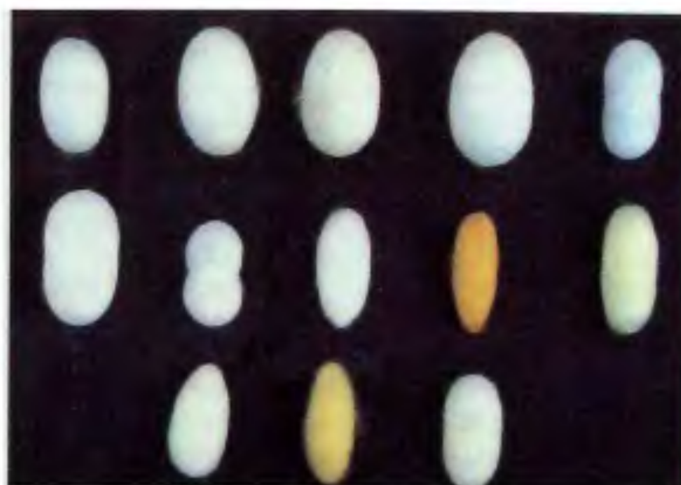
Figure 1. Genetic resources of silkworm. An array of larval mutants (upper panel); different ecotypes and inbred lines showing various cocoon shapes, sizes and colours (middle and lower panels).

Chromosome) or BAC (Bacterial Artificial Chromosome) if one plans to use the genetic map for positional cloning using YAC or BAC Library. In order to pursue this scale of molecular map one requires high volume marker technology.