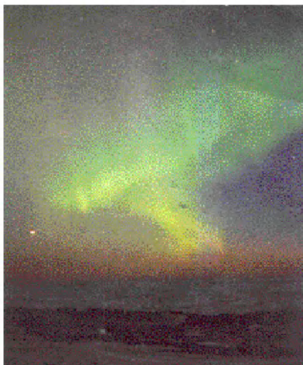
Figure 1. Natural aurora.

When the sun is active with intense solar flares, geomagnetic disturbances of large amplitude called a magnetic storm take place. These geomagnetic storms can in some cases induce electric currents in the earth that are known to interfere with electric power transmission equipment. They can cause failure of satellite systems. In the present context, the solar wind reaches supersonic speed (about