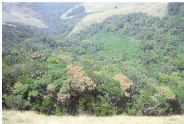
A patch of tropical evergreen forest in KMTR — much of the endemic biodiversity is found in the evergreen forests.