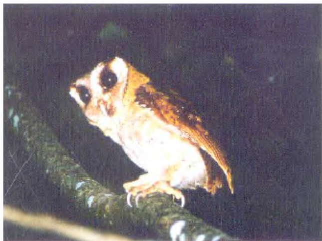
The Oriental Bay Owl ( Phodilus badius ) in Sengaltheri.

turtle), Hemidactylus anamallensis (Anaimalai gecko), and Otocryptis beddomii (Indian kangaroo lizard).