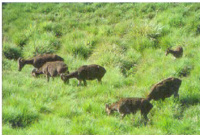
A herd of Nilgiri tahr: Conservation of this endangered mountain goat in KMTR requires research inputs, planned management, and monitoring.

May 1971. Mundanthurai Wildlife Sanctuary (567 km 2 , Ambasamudram and Mundanthurai ranges and Singampatti Zamin) was declared a Tiger Sanctuary in 1962 and designated as a Wildlife Sanctuary in 1977. After my surveys in these hills in 1983–1984 as the Elephant Project Scientist of BNHS, I visualized a conservation plan for Kalakad–Mundanthurai and suggested that this area should be adopted by Project Tiger 1 , which became a