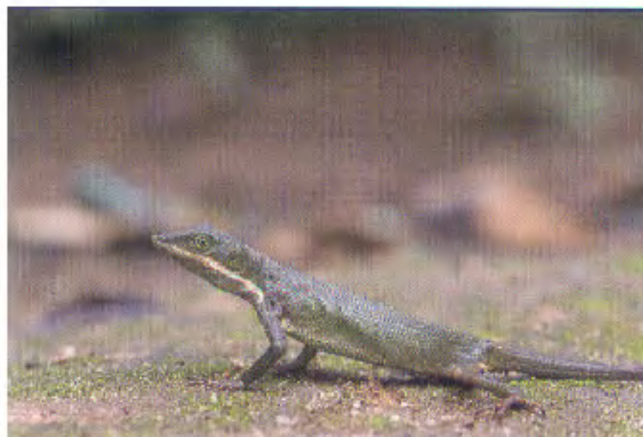
The recently rediscovered rainforest lizard Calotes andamanensis is known only from KMTR.

The total number of reptilian species in India is 480, of which the Western Ghats have 197, so far, around 55 species have been reported from the rainforests of KMTR. N. M. Ishwar (pers. commun.) reports that the number of reptilian species from KMTR is around 81, which is quite high for any single protected area. Some species of biological and ecological importance are Calotes andamanensis 35 , Geoemyda silvatica (Cochin forest cane-