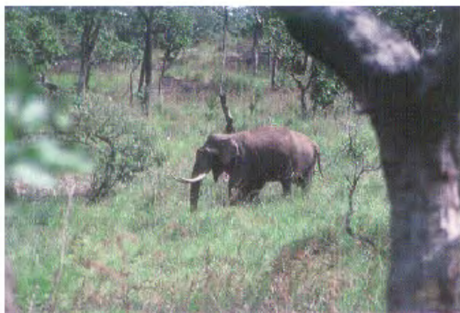
A wild Asian elephant tusker in KMTR.