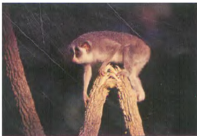
KMTR is an important area for research on and conservation of the nocturnal slender loris.