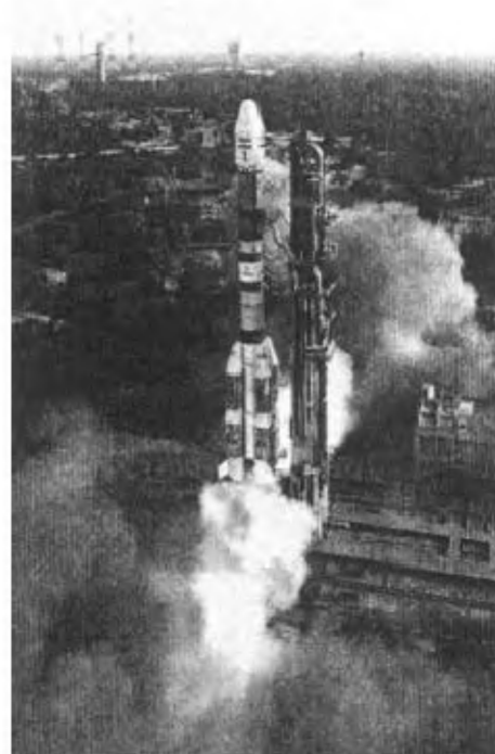
Figure 1. GSLV-D2 take-off.

The second stage (GS2) of GSLV is 11.6 m long and 2.8 m in diameter. It is filled with 39 t of hypergolic propellants UH25 and N_2O_4 . It produces a vacuum thrust of 804 kN and burns for about 135 s.