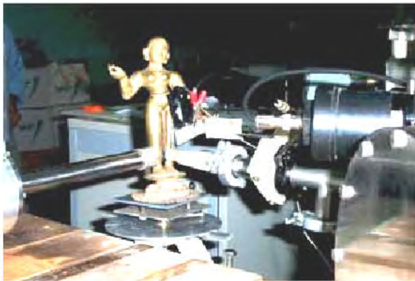
Figure 1. External PIXE set-up at IOP.

allowed to travel 3 cm in air by which time the energy gets reduced to about 2.4 MeV, and the proton beam then irradiates the samples. The external PIXE set-up is shown in Figure 1. Beam-charge measurement is carried out using a rotating chopper as described by Mando et al. 6,20 . A rotating vane chopper of adjustable length is used for charge measurements 21 . The chopper disc of diameter 15 mm is placed between the exit window and the sample at a distance of 3 mm from the exit window. The chopper vane is fully isolated from the electrical motor as well the beam line using insulation, and is connected to the current integrator for recording the charge. The charge measurement of the chopper is calibrated using the pure copper foil.