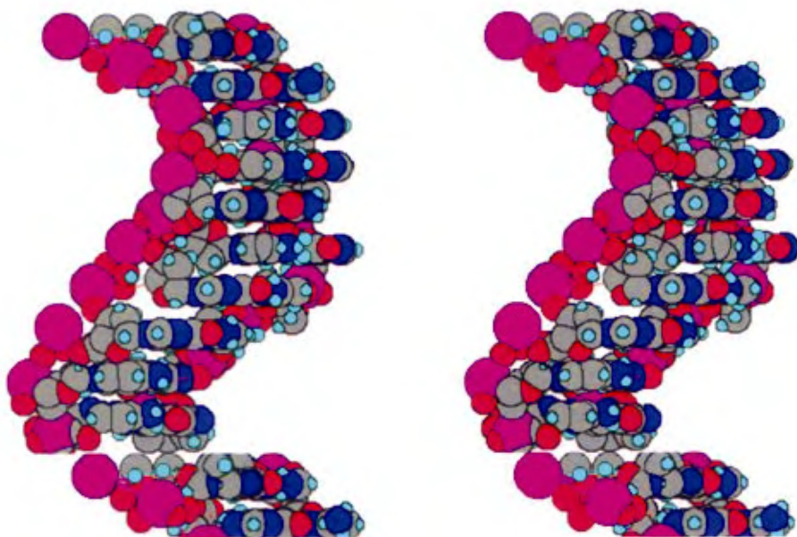
Figure 3. A paranaemic structure for the B form of DNA (ref. 4).

Stokes 38 showed in 1955 that the ‘X’ structure applied to fibres with axial ordering such as DNA, could be used to calculate the helical diameter of the macromolecules. Using Franklin’s scattering pattern of B-DNA, this gives