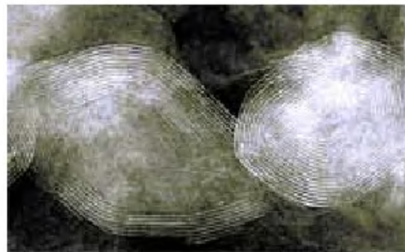
Figure 2. TEM image of the as-prepared powder.

Although some efforts in materials science are still directed towards developing new methods for the fabrication of nanomaterials, more attention is being directed presently to control of the size and shape of nanoparticles. We have demonstrated over the years that the control of the particle size is quite easy when using sonochemistry. It is accomplished simply by varying the concentration of the precursor in the irradiated solution. The more dilute the solution, the smaller the particles. The shapes of the products of the sonochemical process are less predictable. A major factor is the presence or absence of a surfactant. We can just mention that shapes such as olympic nanorings ( \text{BaFe}_{12}\text{O}_{19} ) (ref. 13), nanocylinders ( \text{GaOOH} ) (ref. 14), nanotubes ( \text{TiO}_2 ) (ref. 15), nested inorganic fullerenes ( \text{Ti}_2\text{O} ) (ref. 16), and spheres have been among the shapes of the sonochemical products. The inorganic fullerenes presented in Figure 2 were obtained as part of a study in which the sonohydrolysis of group III A (Ga, Al, In and Tl) in the periodic table was conducted. An aqueous solution of the chlorides of these metals was sonicated at room temperature. The sonohydrolysis of \text{TlCl}_3 yielded onion-like nested fullerenes. They were assigned