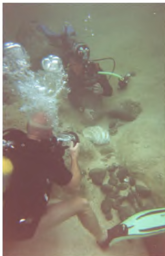
Figure 6. Divers with the clam.