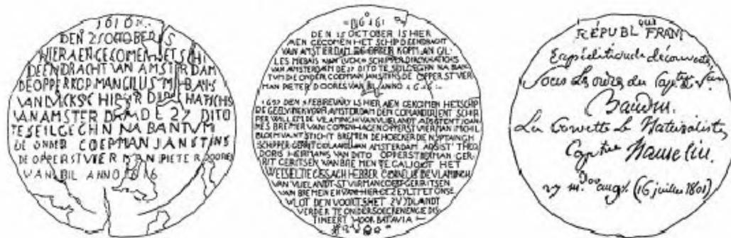
Figure 7. The three plates.

Jaques Arago, recorded that 'The principal object of the expedition was the investigation of the figure of the earth,