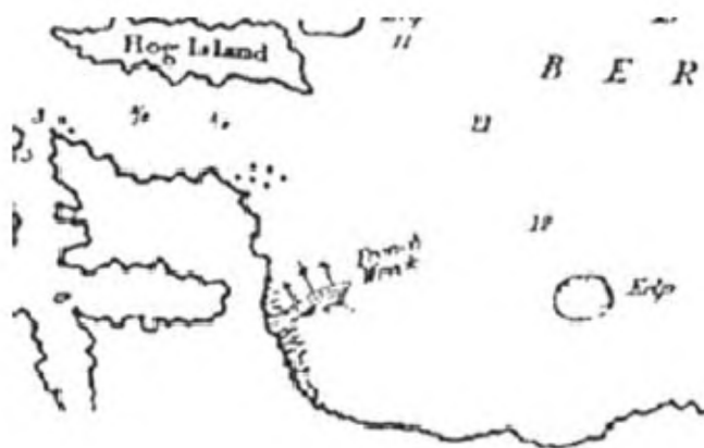
Figure 9. Uranie Ashore. From Weddell, A Voyage towards the South Pole .

Of its lost exploration ships L'Uranie is a representative of the post Napoleonic period, at a time when France still sought colonies on the Great South Land for its own purposes and partly as a foil to British intentions. The vessel