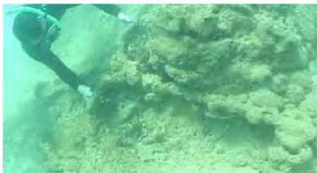
Figure 5. The grapnel.

As a matter of course and as agreed by the team before departure, the remains of HM Ship Roebuck at Long Beach were formally claimed by the team for the Royal Navy, Britain and Ascension Island, paving the way for their declaration as one of the world's most significant and virtually untouched maritime archaeological sites. In recommending that the site be afforded legal protection by the declaration of a restricted zone, it was requested that it be considered part of the joint maritime heritage of Britain,