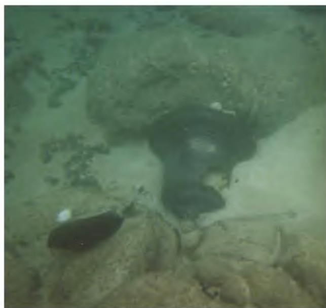
Figure 4. The Roebuck Bell as found.

After just under an hour of searching with Kimpton along the transit lines set on the beach, Lashmar descended and while swimming along the bottom he located a bronze bell on the 9th transit line (Figure 4), lying uncovered but affixed to a cleft in rocks c. 90 m from shore on a