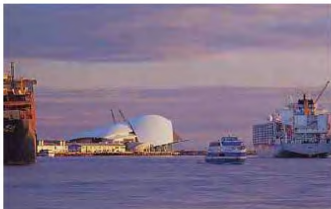
Figure 1. The new Western Australian Maritime Museum.

Most maritime scholars are familiar with William Dampier through his own works and those of his commentators,