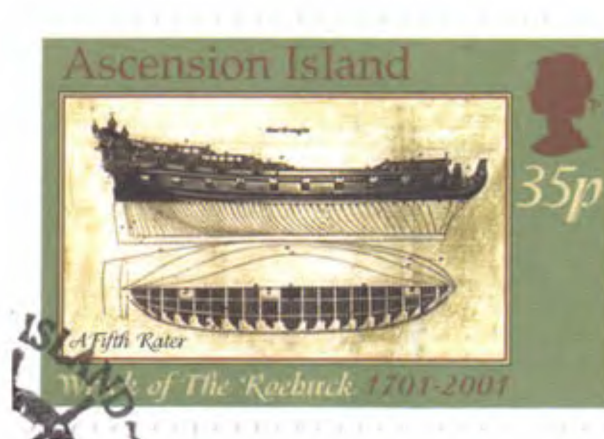
Figure 3. A stamp commemorating Roebuck and its voyage.

At three o'clock in the afternoon being in sight of the Island Ascension. At half an hour after 8 in the night we sprung a Leake on the larboard bow about four Strakes from the Keele, which obliged us to keep our Chain pump constantly going, at twelve at night having a moderate gale, we bore away for the Island and by daylight were close in with it, at nine o'clock in the morning anchored in the N.W. bay in ten fathom and half water, sandy ground about half a mile from the shore, the S. point of the bay bore S.S.W. dist. one mile and a half and the northernmost point, N.E. 1/2 N. dist. two miles. Being come to anchor, I ordered the Carpenter's Mate with the Boat-