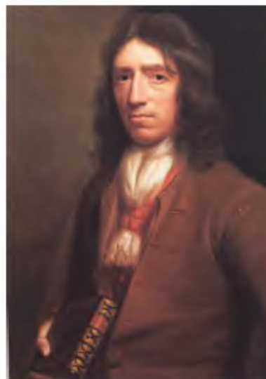
Figure 2. William Dampier 'Pirate and Hydrographer' (Photo: National Portrait Gallery, London).

'I had a lingering view of approaching Death, and little or no hopes of escaping it. And I must confess that my Courage, which I had hitherto kept up failed me here, and I made very sad Reflections on my former life, looking back with horror and Detestation on Actions which before I disliked, but now trembled at the remembrance of. I had long before this repented of that roving course of Life, but never with such Concern as now'.