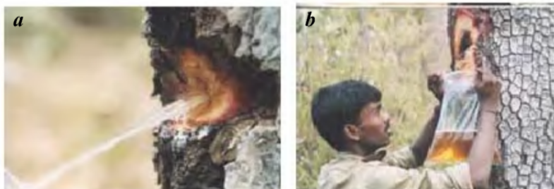
Figure 1. a , Water rushing out of T. tomentosa stems. b , Potable water being collected from the stem.

Although slightly off-flavoured and orange-yellowish in colour (may be due to dissolved phytochemicals), the water