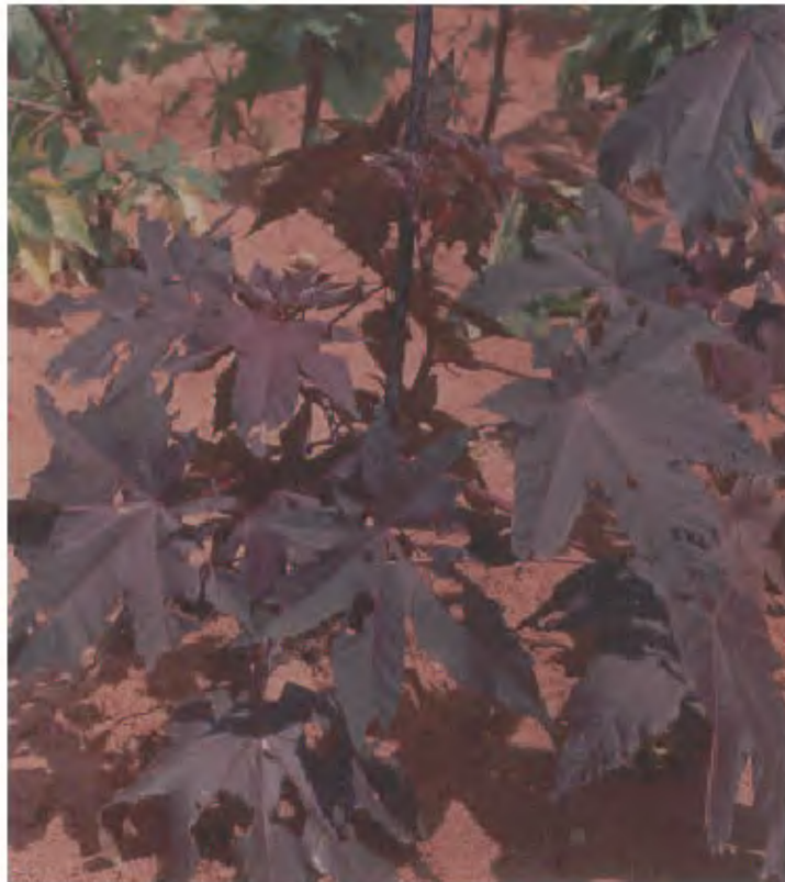
Figure 1. Purple colour castor morphotype.

So far these are the lone and the first reported sources of multiple resistance to Fusarium wilt and leafminer in castor. No effective controlling measures are available to control wilt and leafminer; breeding of resistant cultivars by introgressing resistant genes from the resistant sources is the only effective way to control them. The purple colour of the plant did not dilute, as it grew older. Expressivity of purple