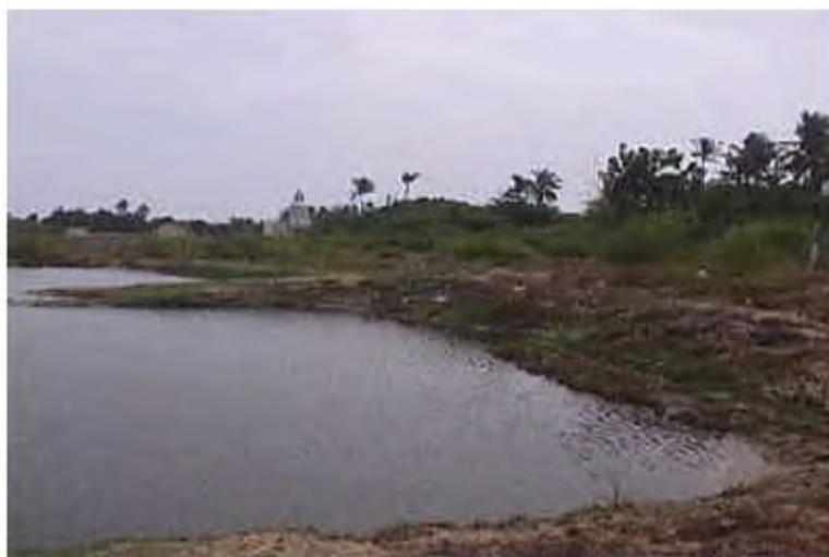
Figure 2. Contaminated surface water source in Pradhabaramapuram village, Nagapattinam district.