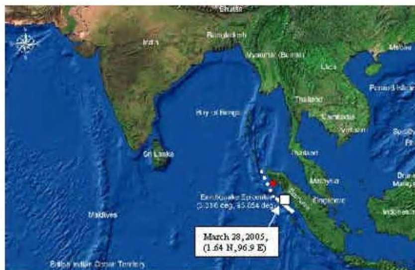
Figure 1. Location of Sumatra90 and Sumatra87 earthquakes and general layout of the rupture region. Sumatra87 occurred in an area which was already ruptured during 1861 earthquake.

from the point of view of available total kinetic energy. However, the effective bulk modulus of rock in the two cases means a large difference due to large difference in the depth of occurrence below the mantle. While Sumatra90 was at the depth of 17 km, Sumatra87 was at the depth of 30 km (as reported in preliminary report from USGS 3 ). This means that the efficiency of kinetic energy transmission to the ocean water due to rock resistance is far lower in the latter case. Tsunami generation is affected by dip-slip changes and therefore, the position of the epicentre zone with respect to the subduction zone is important. In the case of Sumatra90, it occurred near the subduc-