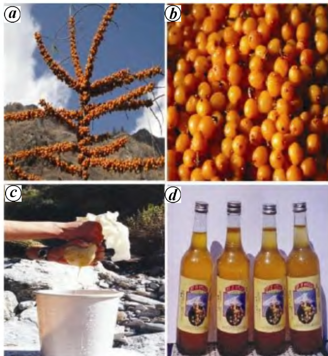
Figure 2. Hippophae rhamnoides . a , Full blooms of ripened plant; b , Fruit berries; c , Juice extraction; d , Locally prepared juice.