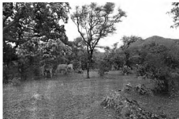
Figure 2. Livestock grazing and degraded dry forests in the Sigur region.