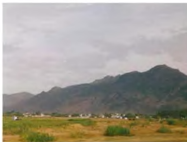
Figure 3. Degraded dry forests adjacent to settlements along the eastern boundary of the Kalakad–Mundanthurai Tiger Reserve.