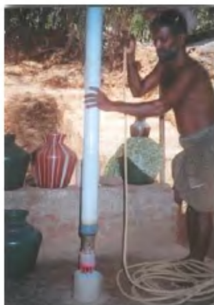
Figure 2. Pulling out the system from the borewell.

unit closes due to the weight of water inside the PVC pipe. The next step is to remove water from the PVC pipe. The system is kept inside a bucket/vessel and the bolt projecting out of the foot valve is pressed, resulting in the valve being opened. Water from inside the PVC pipe flows out and is collected in a vessel. The system at Chelakkara is capable of drawing 5.5 litres of water at a time.