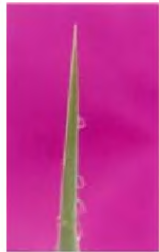
Figure 1. The guttational water drops oozing out of hybrid rice leaf (cv. NDRH-2).

These findings on guttation in rice are novel. Its measurement is easy, simple, accurate, non-invasive and quick to perform. This technique does not need costly and cumbersome equipment and requires much less time than other known laboratory or field methods/techniques of