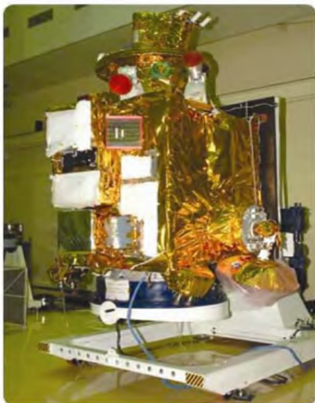
Figure 2. The Chandrayaan-1 spacecraft.