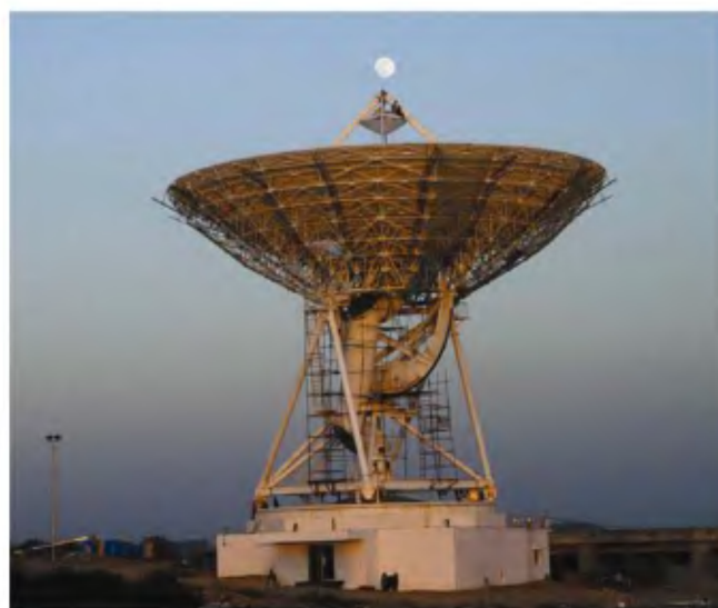
Figure 4. The 32 m Indian Deep Space Network antenna with the Moon in the background.

The Chandrayaan-1 spacecraft was launched on 22 October 2008 using a variant of the flight proven indigenous Polar Satellite Launch Vehicle (PSLV-XL) and injected into a 255 \text{ km} \times 22,860 \text{ km} orbit. After separation from the launcher, the solar panel was deployed and the spacecraft raised to moon rendezvous orbit by five consecutive in-plane perigee manoeuvres to achieve the required 386,000 km apogee that placed it in a lunar transfer