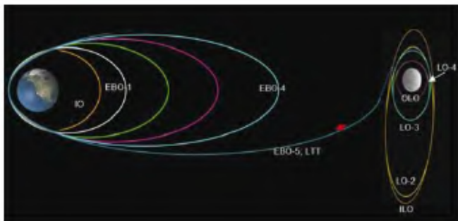
Figure 5. A schematic view (not to scale) of the Chandrayaan-1 mission profile. The spacecraft placed in the initial orbit (IO) by PSLV-XL was followed by five consecutive in-plane perigee manoeuvres in earth bound orbits (EBO) to place it in the lunar transfer trajectory (LTT). The next major manoeuvre, lunar orbit insertion, led to lunar capture in an elliptical initial lunar orbit (ILO). Four further orbit manoeuvres in lunar space placed the spacecraft in the operational lunar orbit (OLO) around the pole at 100 km altitude.

trajectory. The major manoeuvre, lunar orbit insertion leading to lunar capture, was executed to place the spacecraft in an elliptical (500 km \times 7500 km) polar orbit. After checks of various spacecraft sub-systems, three further orbit manoeuvres were conducted to place the spacecraft at the designated 100 km circular polar orbit. The mission profile and the various orbit manoeuvres are schematically shown in Figure 5.