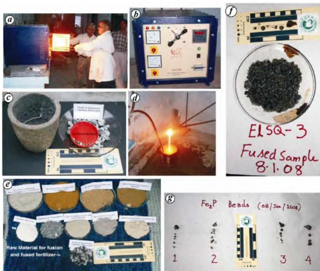
Figure 1. a , Fused material being removed from the furnace. b , Furnace control panel. c , Crucible used for fusion with fused \text{Fe}_2\text{P} beads. d , Quenching of melt in running water. e , Various raw materials. f , Product FCMP obtained from fusion of El-nasr ore. g , Beads of ferro-phosphorus recovered from the fused material.