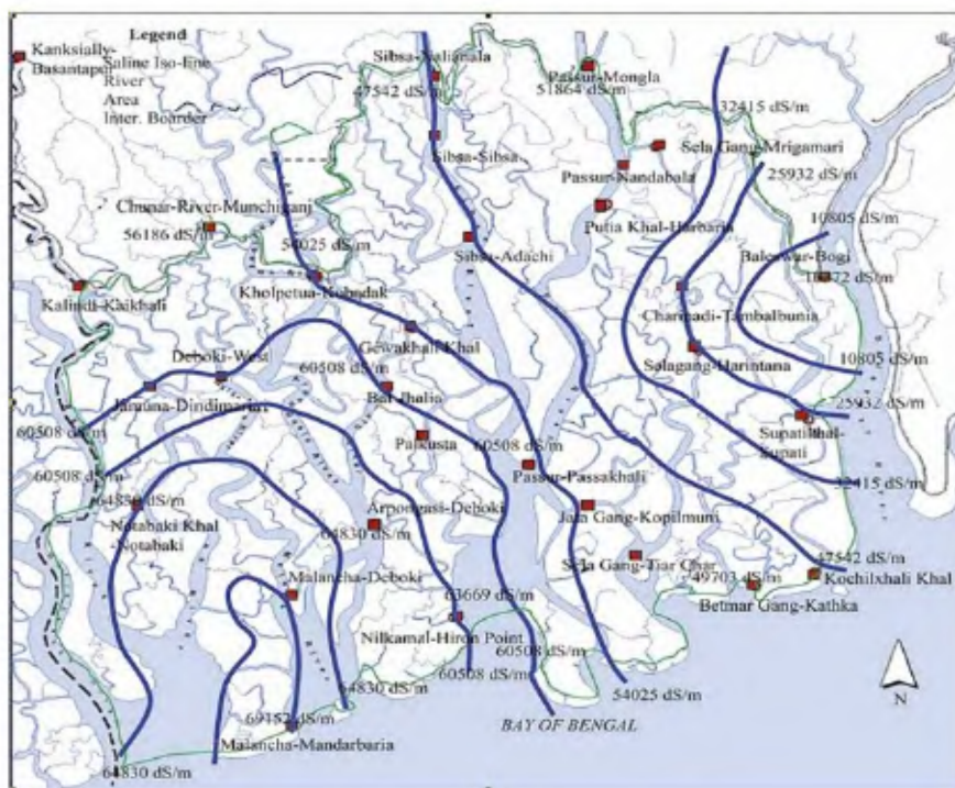
Figure 3. Water salinity isohalines in Bangladesh Sundarbans (reproduced with permission from Noor and Gnauck 4 ).

Farakka barrage shows that the river water salinity in the Sundarbans region of Bangladesh is much higher in the southern and southwestern rivers, moderate in the middle, and lower in the northern part (Figure 3) 4 . No such detailed study on soil or water quality parameters was however undertaken in India. A holistic approach is required to ensure security to the inhabitants on either side of the Ganga 1 .